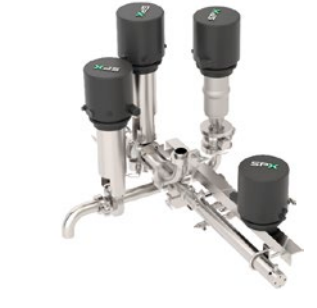
ILLUSTRATIONS OF SCRAPING SYSTEM TYPE B

Particularly suitable for processes such as fruit injection which do not require cleaning between product changeover.